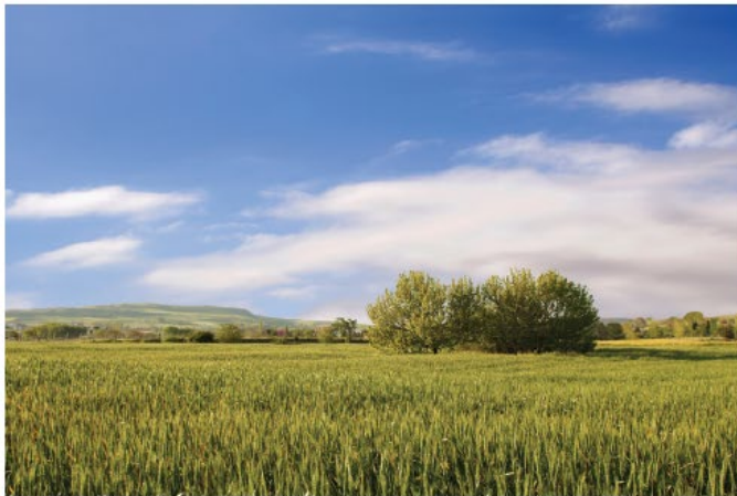
Figure 1.4. Building Location without Supporting Infrastructure and Services

By improving the efficiency of buildings and communities, we can significantly reduce greenhouse gas emissions.