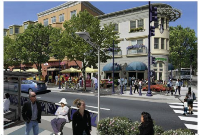
Figure 1.5. Building Location with Infrastructure and Services